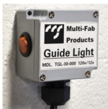
Loading Dock Guide Light